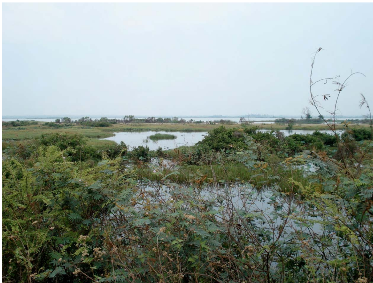
Figure 2. Nong Souy, Savannakhet province, Lao PDR, 3 March 2007, showing the bush-studded wetland typical of non-urban sites with Yellow-vented Bulbul records in Lao PDR. The foreground bush is the invasive American Mimosa pigra , which is also spreading rapidly in Lao (Photo D. Van Gansberghe).

attributing their changes in status in Lao PDR to genuine expansion.