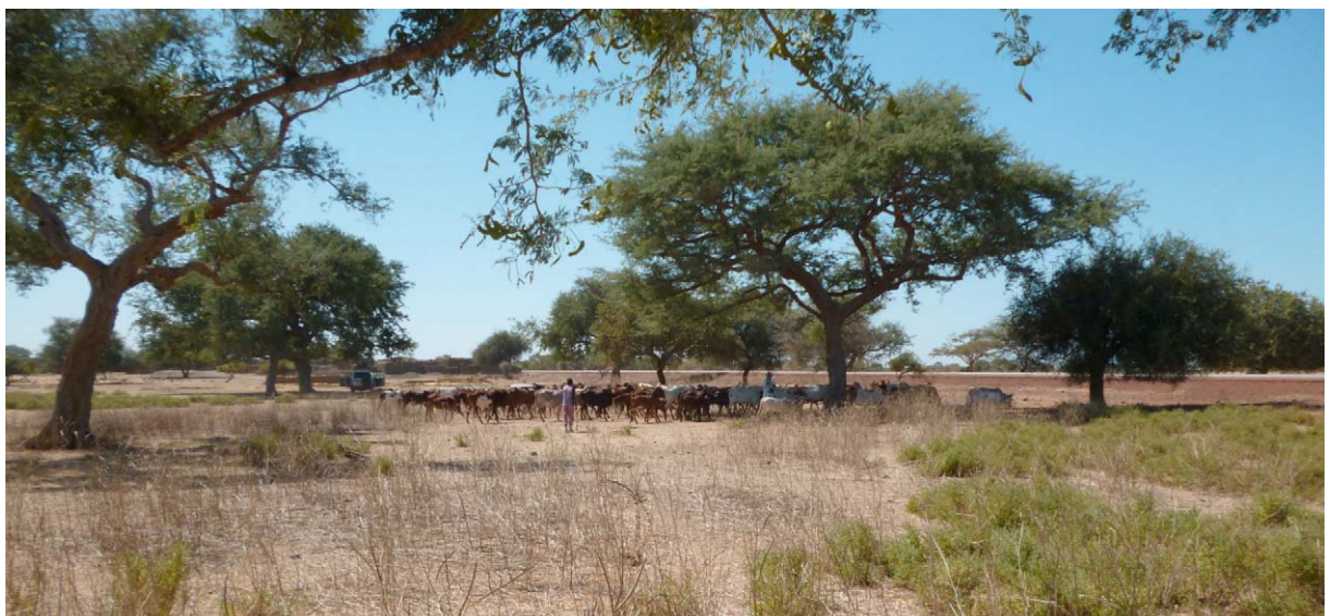
Large Faidherbia trees, especially when flowering (November), are of utmost importance to Palaearctic passerines; north of Mopti, Mali, 27 November 2013. Each tree may harbour a Pallid Warbler Hippolais pallida , one or two Subalpine Warblers Sylvia cantillans and Bonelli's Warblers Phylloscopus bonelli , depending on crown width.

One of these problems has almost reached the status of a dogma: the mismatch between spring arrival/start of breeding and food peak during the breeding season. Remember: food peak in Europe is often used as a synonym for caterpillar peak. To be more precise: a peak in the caterpillars of Operophtera brumata and Tortrix viridana . There is no denying that the past few decades have shown an advancement of phenology in many organisms, be it plants, insects or birds. A plethora of studies, mostly from the northern