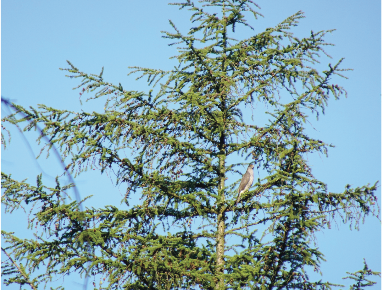
Adult female Northern Goshawk on high alert in a larch some 75 m away from her nest with three chicks of 21–22 days old. The nest visit (for ringing and taking biometry) took 20 minutes, before, during and after which the female was present but completely silent (photo Rob G. Bijlsma, Forestry of Smilde, 10 June 2023).

the mass range of 75–500 g have been recorded. Many of those species depend on farmland for food, like Common Woodpigeon Columba palumbus and Common Starling Sturnus vulgaris . (The epitaph ‘common’ is a fair reminder of past days.) For example, in woodlands on sandy soils in The Netherlands biomass of medium-weight bird species declined by a whopping 75% or more between the 1960s and 2010s in summer, and an even larger decline occurred in winter (Bijlsma 2020). Similar trends in raptor numbers, reproductive output and prey biomass have been noted in other Western European countries, e.g. in Denmark (Nielsen et al. 2023) and in Germany (Muskens et al. 2016, Looft 2017, Reibisch et al. 2021). In these regions, just as in the eastern Netherlands, Common Buzzard, Eurasian Sparrowhawk and Northern Goshawk initially recovered and increased after the use of organochlorines in agriculture was banned, but all three species started to decline after the early 2000s.