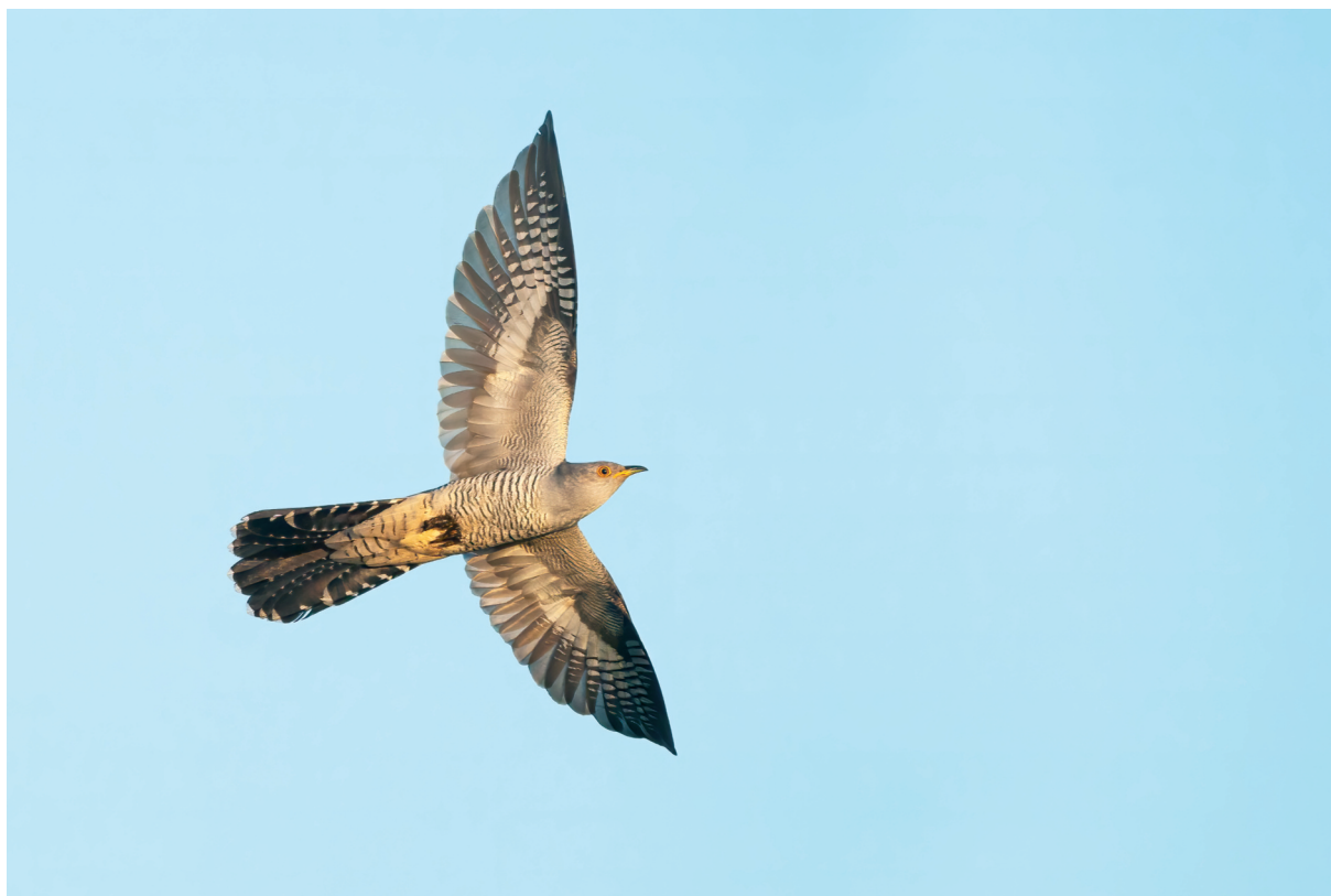
Male Cuckoo flying overhead (Zuid-Holland, 3 June 2011).

To sum up, it is difficult to see how Common Cuckoos are fundamentally different from the shorebirds that I am familiar with, Black-tailed Godwits Limosa limosa , for example. In these Godwits, the young of the year do not travel with their parents and on average they migrate later than the adults (Verhoeven et al. 2022), just like Common Cuckoos. Nevertheless, all our observations are consistent with the idea that the development of their migratory routines relies on the accumulation of experiences including forms of learning (e.g. Loonstra et al. 2019, Verhoeven et al. 2022).