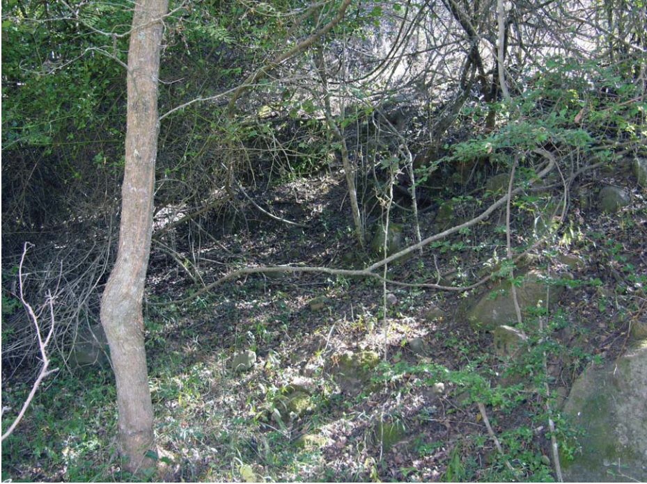
Fig. 7. Habitat at Sanyati Farm where the holotype and one of the paratypes of M. erasmusorum sp. n. were collected.

As reported by Dr R.M. Miller, the collecting site of the other two paratypes was most probably along the small river that runs down the valley with indigenous forest.