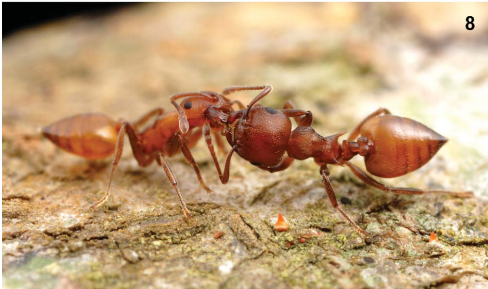
Figs 7, 8. (7) Food exchange ends when the fly retracts its mouthparts. The ant briefly sits motionless following the interaction; (8) Trophallaxis food-sharing behaviour between two Crematogaster castanea tricolor nestmates.