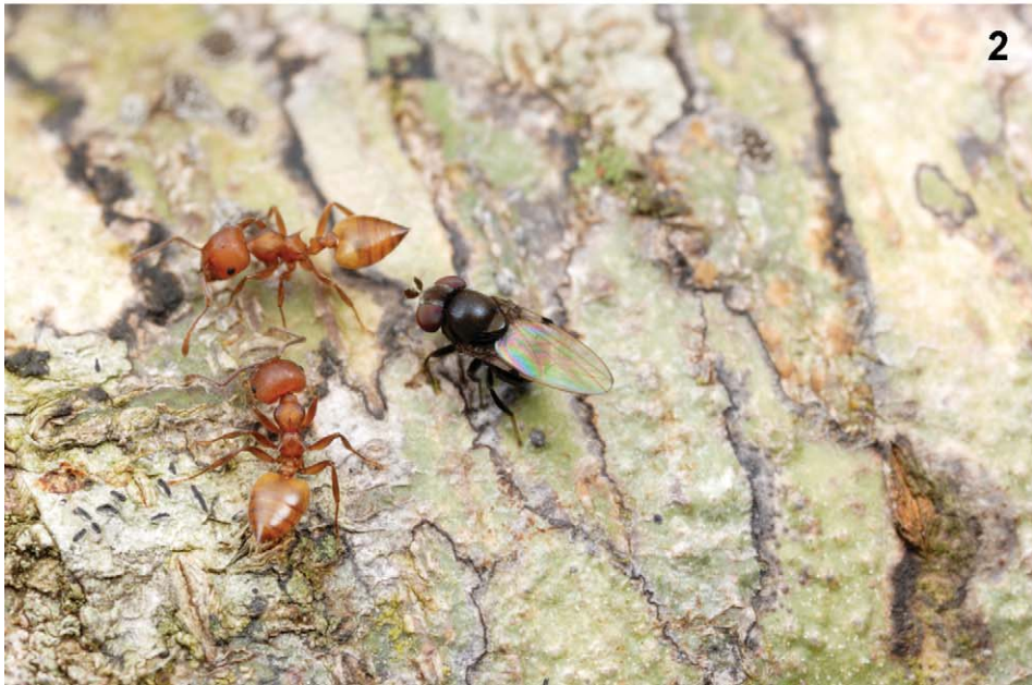
Figs 1, 2. (1) M. patrizii next to a C. castanea tricolor trail on an Acacia branch; (2) A Milichia darts into the middle of the Crematogaster trail to pursue an individual ant. This attempt was unsuccessful, as the ant was able to move past the fly without stopping.