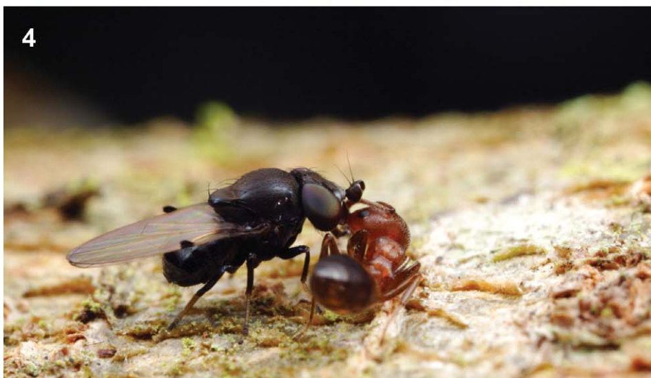
Figs 3, 4. (3) Milichia patrizii pacifies an ant in a successful attack by grabbing the ant's antennal club between the paired basoflagellomeres of its own antennae; (4) The same attack as pictured in Fig. 3. The ant crouches down while the fly initiates regurgitation process by extending its proboscis into the mouthparts of the ant.