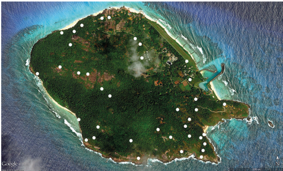
Fig 1. Map of Frégate Island, sampling sites indicated by white dots.

Field sampling sites were determined by initially conducting a repeatable pilot study. The island (Fig. 1) was divided into habitat types based on the vegetation map of Henriette and Rocamora (2009) and was searched for the presence of burrows. Vegetation types are clearly distinguishable as a result of large-scale anthropogenically induced vegetation changes. Ground truthing determined the precise location of these various habitats. In each described habitat an extensive search was conducted between the beginning of February and the end of March 2010 on three separate occasions. Leaf litter was searched through, rocks and logs were overturned and replaced, and all other litter was searched to find burrows. This allowed for the determination of habitats in