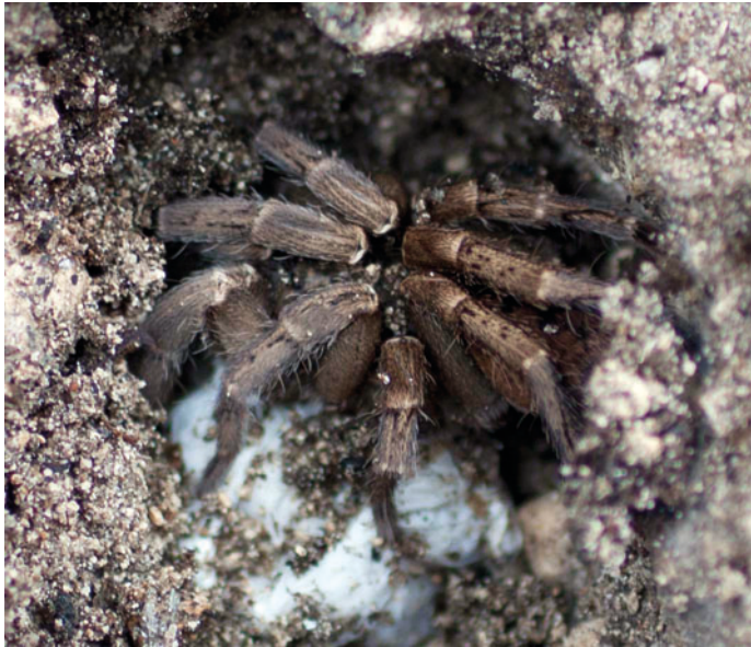
Fig 2. Female Nesiergus insulanus with egg sac in burrow and displaying defensive behaviour type: immobility-body cover.