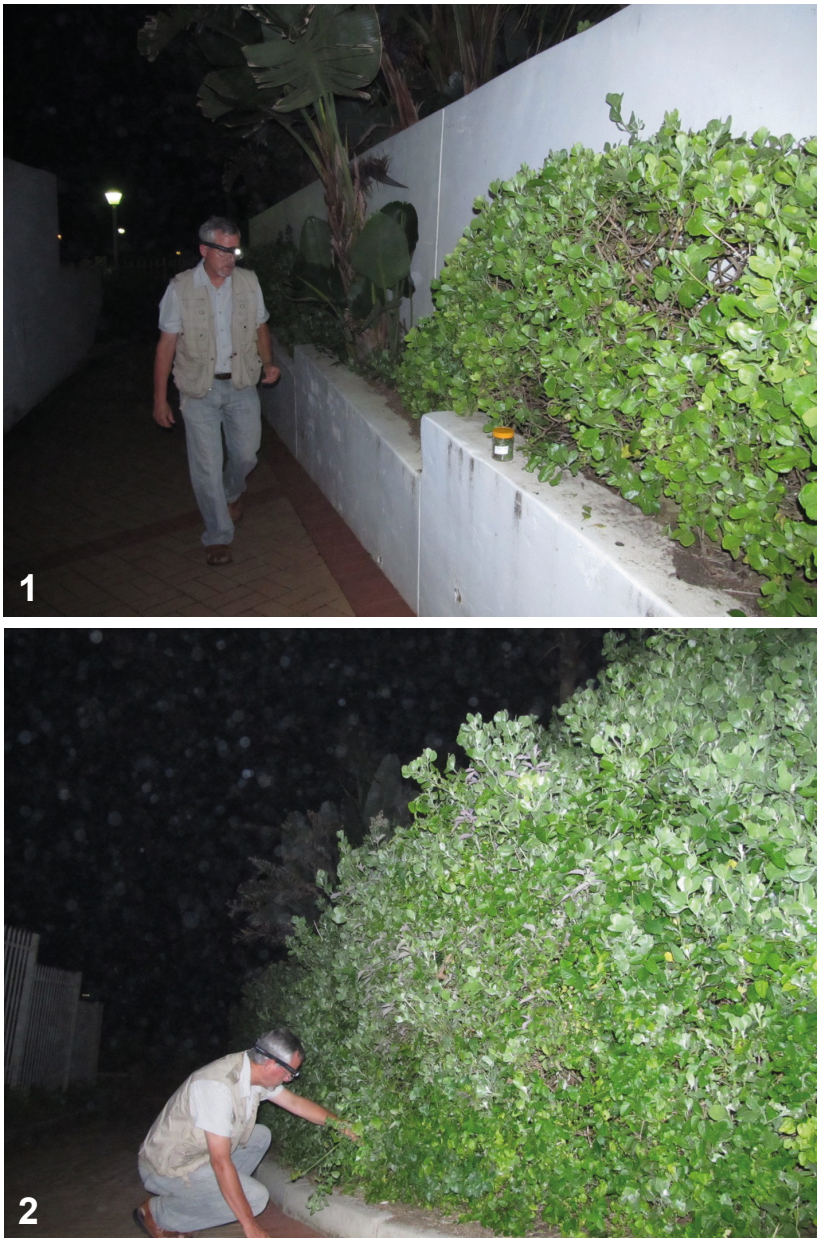
Figs 1, 2. Photographs at night of senior author D.S. Glazier near rows of bietou bushes Chrysanthemoides monilifera rotundata along walkways near The Promenade of Umhlanga beach, South Africa. These are two of the sites where numerous individuals of the isopod Tylos capensis were observed climbing on bietou bushes.

edges), whereas those from Yzerfontein were thicker (more succulent) and more smoothly rounded, thus more closely matching those of the subspecies C. monilifera rotundata observed at our field site in Umhlanga (cf. Weiss et al. 2008). However, the