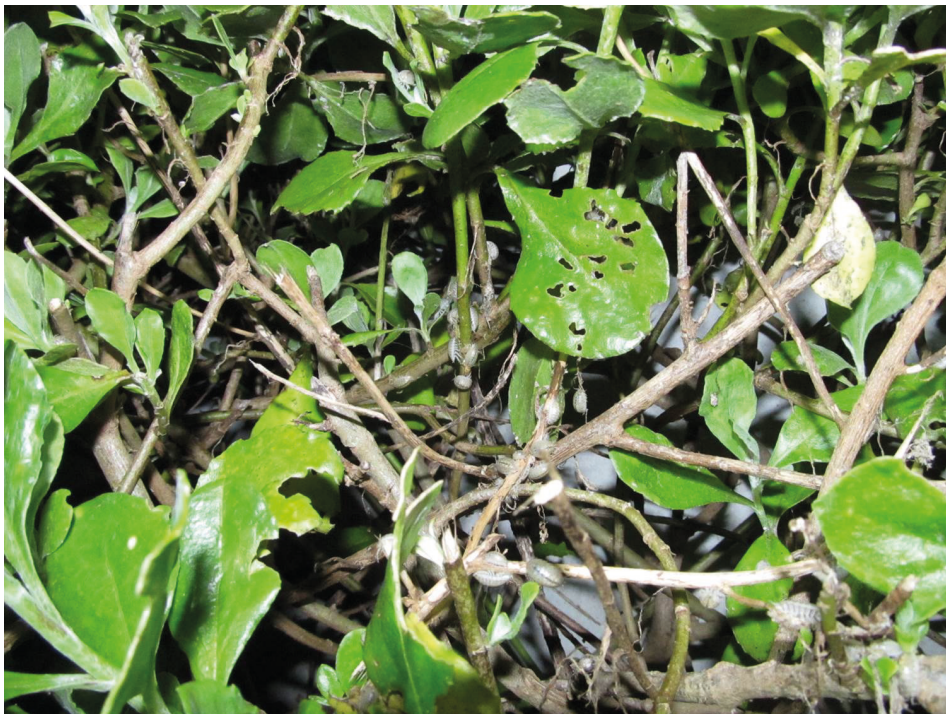
Fig. 3. Photograph at night of individuals of the isopod Tylos capensis climbing on stems and leaves of the bietou bush Chrysanthemoides monilifera rotundata along a walkway near The Promenade of Umhlanga beach, South Africa. Note the holes and cut-out margins of some of the leaves indicating feeding activity.

Tylos capensis exhibits an unusual behavior for a terrestrial isopod: it not only eats live leaves still connected to a plant (rather than dropped as litter), but also climbs up stems as high as 1 metre or more above the ground to reach them. Furthermore, it can