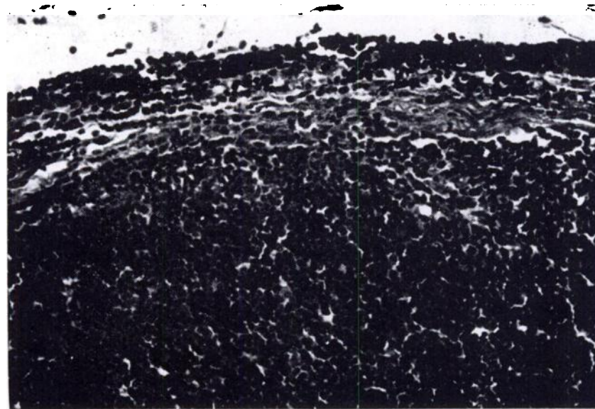
FIGURE 2. Thymic lymphoma in one thymus of a female white-footed mouse. Only \frac{1}{8} of the width of the thymus is shown. X 125.