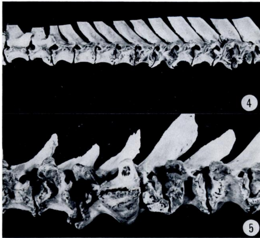
FIGURE 4. Lateral view of macerated vertebral column (thoracic) of 9 year old male deer. Osteophytes are present on the lateral and ventral margins of many vertebral bodies.

Degenerative changes were observed in the cartilage on the anterior aspect of the femoral head, and on both articular surfaces of the atlanto-occipital joint. Vertebral body osteophytes were present on the anterior margins of vertebrae T 4 to T 8 and T 11 , and on the posterior margin of vertebrae T 3 to T 11 and L 4 . Intervertebral discs were absent in the intervertebral spaces from T 3-4 to T 9-10 . The largest osteophytes (1-2 cm) were located on the posterior aspect of T 8 , T 9 and T 10 and occupied a lateral position on the vertebral body.