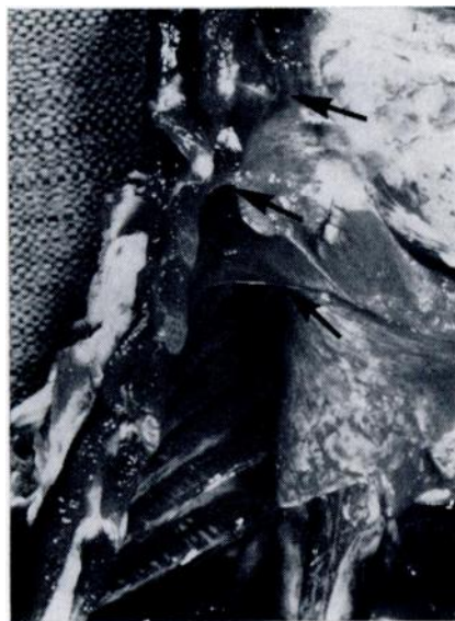
FIGURE 3. Adhesions between the anterior lobes of the right lung and the thoracic wall (arrows) of a raccoon thought to have been infected with Paragonimus kellicotti .

Recovery of P. kellicotti from 5.7% of the striped skunks examined constitutes the first report for the lung fluke in this host in Ontario and only the third time it has been recorded in the striped skunk. It was previously found in 6 of 41 skunks (15%) examined from two areas in Georgia 20 and in a single animal from Minnesota. 6 Although the flukes grow very large in striped skunks, 20 the histopathologic features of this infection 22 suggest that this host is not well adapted to P. kellicotti . The host-parasite association may be poorly adapted because crayfish are not frequently eaten by striped skunks. 6 Lesions on the liver as-