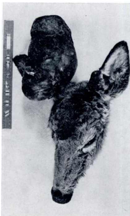
FIGURE 1. Partially ossified fibromas of a white-tailed doe. Note ear tags being enveloped by the fibromas.

The 5½ year old doe was emaciated (43.6kg) with depleted subcutaneous, pericardial and perirenal fat reserves. The mean kidney fat index 10 was 13.5%, and the femur marrow was red and gelatinous, containing 36% fat. 12 The rumen contained 84% deciduous leaves and woody twigs. The remaining 16% was rose hips and grass. Two Taenia hydatigena cysticerci were found in the abdominal mesenteries. The doe had been bred in the 2nd week of November, as determined from crown-rump measurements of a male and a female fetus recovered from the uterus. 1,4 No gross abnormalities or lesions were noted in the fetuses or in any of the internal organs of the doe. A darkly pigmented growth on the right ear measured 25 cm x 15 cm and weighed 2.3 kg (Fig. 1). It