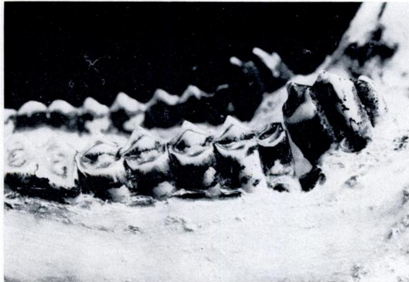
FIGURE 2. Buccal view of the left mandible. Note the distinct gap between the third and fourth molars, the slight wear on the anterior surface of the fourth molar and the well worn condition of the first molar relative to m2 and m3.