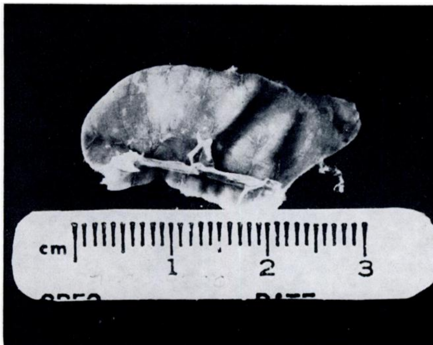
FIGURE 2. Pale tan foci in the submucosa are visible through the serosal surface of the intestine of a red-headed falcon (case 2).

In the bone marrows the grossly observed focal lesions were found to be islands of coagulative necrosis, often containing much nuclear debris, in a sea of degenerating erythroid and myeloid elements. The marrow sinusoids and vessels were intact except in the areas of coagulation necrosis. In the gyrfalcon (case 6) there was necrosis of the bone marrow in the myeloid spaces of the ossified tracheal rings. Inclusion bodies were present but not numerous.