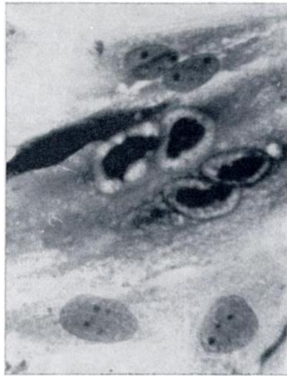
FIGURE 2. Dog kidney cell culture 72 h after inoculation with skunk liver tissue suspension. Note intranuclear inclusions. Giemsa X 800.

Primary dog kidney cells exposed to supernatant fluids from 10% liver suspensions had maximum numbers of intranuclear inclusions at 72-96 h after exposure (Figure 2). The inclusions stained a deep purplish-red with Giemsa. When stained with acridine orange and stained with ultraviolet illumination, inclusions fluoresced bright green.