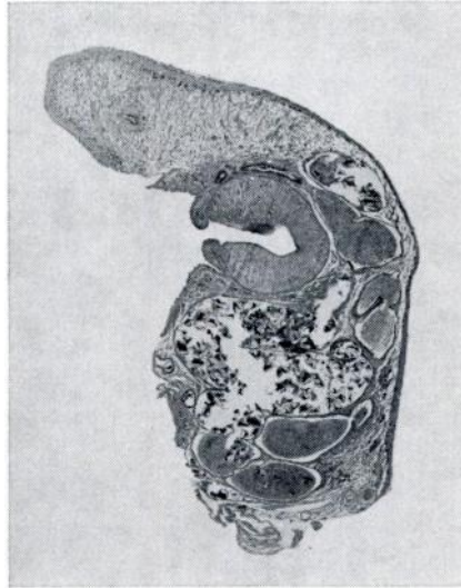
FIGURE 1. Section of adult trematode taken from the round window of the cochlea of a dolphin (X35).

tory system and acoustic behavior of dolphins and whales should be aware of the possibility that parasites could contribute to loss of hearing and thus affect the accuracy of accumulated data.