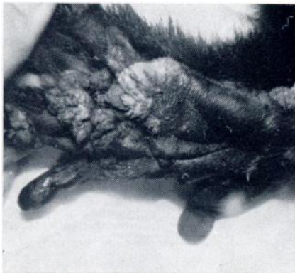
FIGURE 2. Papillomas on feet of Colobus monkey.

Specimens were fixed in 10% formalin and submitted for histologic preparation.