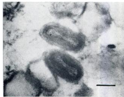
FIGURE 2. Electron micrograph of ultrathin section of hare fibroma. Two poxvirus particles have been cut in cross section, showing outer layers and biconcave nucleoid. Bar = 100 nm.