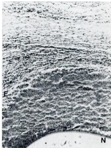
FIGURE 3. Eosinophils surrounding female D. insignis located in the leg of a raccoon. This worm has moved out of tissue capsule. X 95. E, eosinophils, N, nematode.

Microscopically, the affected tissues showed localized oedema with various amounts of fluid and, rarely, small haemorrhagic areas. The connective tissue capsule surrounding larvigerous females in the legs was interspersed with inflammatory cells. Sections of tissues surrounding near-emergent females showed inflammatory cells on superficial surfaces of muscles and, occasionally, degenerate muscle fibers. A purulent exudate, with a preponderance of eosinophils and neutrophils (Fig. 3),