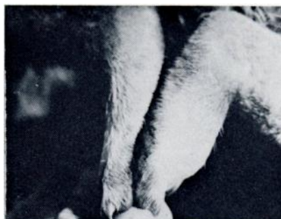
FIGURE 2. Swollen hind foot (on left) of a raccoon experimentally infected with D. insignis .

of hair was observed in animals which indulged in prolonged rubbing and/or scratching. Once the female worms were exhausted the raccoons rapidly recovered and showed no after effects.