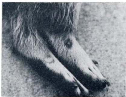
FIGURE 5. Hind feet of a raccoon showing ulcer 18 days after female D. insignis had ceased passing larvae.

In the dishes containing experimental copepods, 40-60% of the L_1 larvae were found dead over the 3 h interval. Many dead larvae showed evidence of mechanical damage. All but three larvae in the control dish were alive after 3 h. When copepods were examined 7 days after exposure most larvae were alive and developing, with only a few dead L_1 larvae. Infected copepods contained 1 to 23 larvae; more than 15 was rare and 4 to 5 was usual.