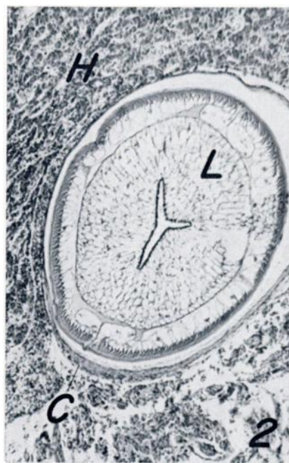
FIGURE 2. Compressed hepatic tissue (H) with associated Anisakis larva (L) and host capsule (C). H&E x74.