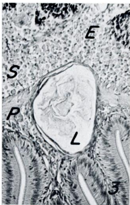
FIGURE 3. Autolytic larva (L) within pyloric caecum (P), serosa (S) and cellular exudate (E). H&E x180.

Mechanical injury to the muscularis externa of a pyloric caecum was noted on one fish, and a single autolytic larva was found in the muscularis externa and lamina propria of a pyloric caecum in a second specimen (Fig. 3).