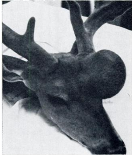
FIGURE 1. The head with the tumor extending over the left eye.

Electron microscopy confirmed that the mass was comprised of fibroblasts and collagen fibers. Viral particles were not seen within the tumor or overlying epithelium.