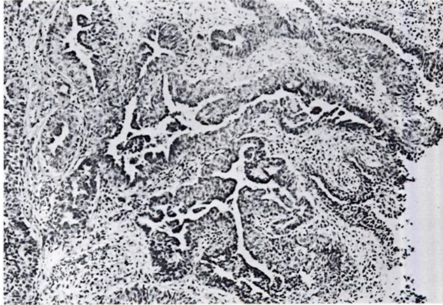
FIGURE 1. Proliferation of squamous tonsillar epithelium and its invasion in deep clefts. H&E \times 63 .