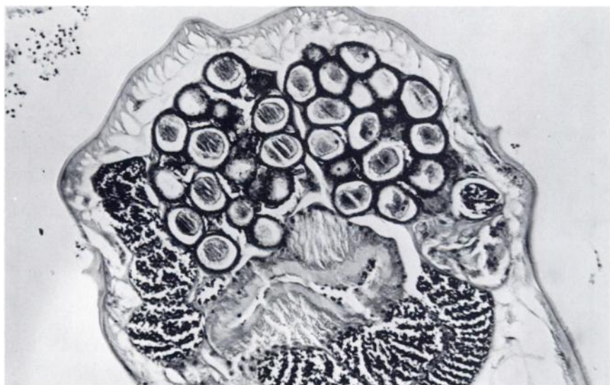
FIGURE 2. Cross section of Lagochilascaris major within granuloma, H&E \times 25 .

have been examined, but no additional animals infected with L. major have been found. Studies to determine the prevalence of this parasite should give insight as to its host and geographic range.