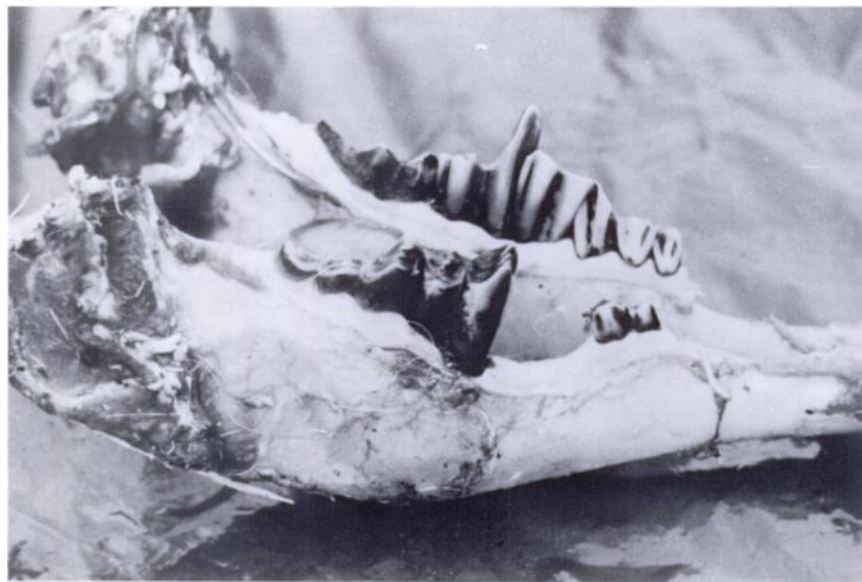
FIGURE 1. Mandibles of a Dall's sheep showing a tooth that is missing or has undergone excessive abrasion resulting in aberrant protrusions of opposing occluding teeth.

Impacted vegetation was observed in some of the mandibles between the gingiva and crown-root junction of molar teeth. The impacted substance, which often consisted of hardened plant material, extended downward along the roots of molar teeth.