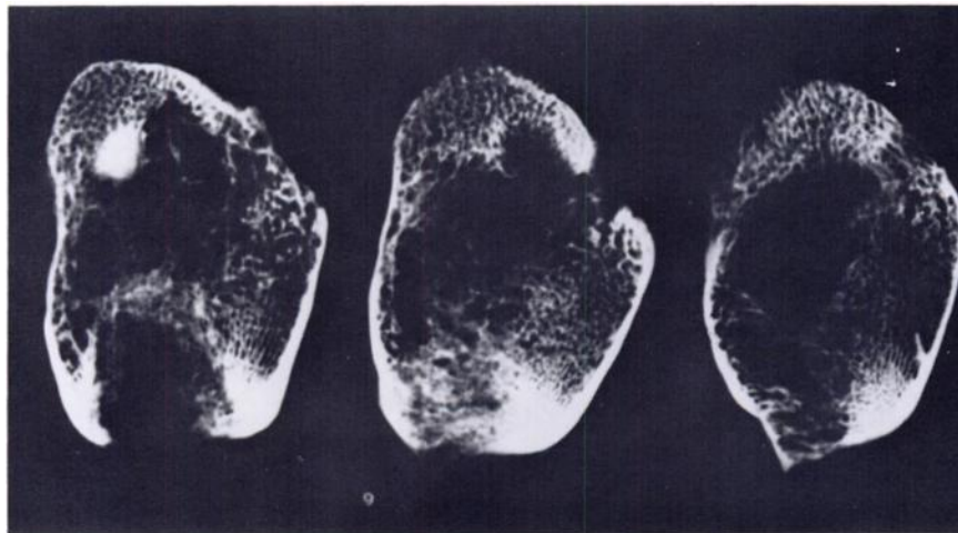
FIGURE 3. Cross sections of affected mandibles showing extensive loss of trabecular and cortical bone.