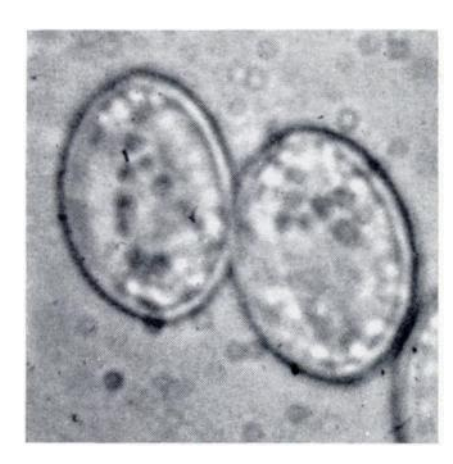
FIGURE 1. Sporocysts of Isospora butconis.