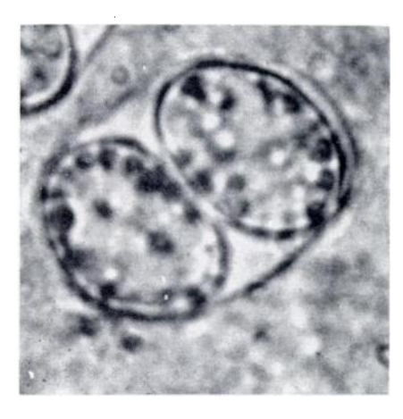
FIGURE 2. Oocyst of Isospora butconis.

10°; formalin solution, sectioned by the Pathology Department and stained with hematoxylin-eosin. Microscopic examination of the sections revealed numerous coccidial oocysts in the connective tissue cores of the villi (Figure 3).