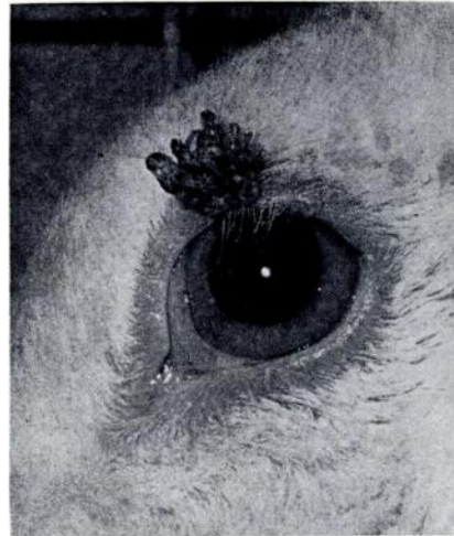
FIGURE 2. Lesion on eyelid of rabbit G-2.

Rabbits with active papilloma infection were completely or partially resistant to reinfection and