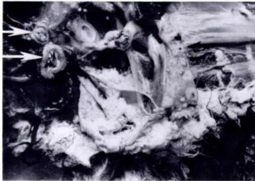
FIGURE 1. Concave plaques (arrows) of Aspergillus fumigatus in a captive tawny eagle.