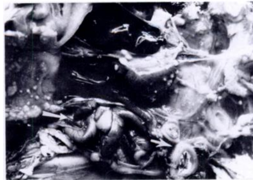
FIGURE 2. Extensive plaque formation with adhesion (arrows) of organs in the abdominal cavity of a captive tawny eagle.

alus ), martial eagle ( Polemaetus bellicosus ), European sparrow hawk ( Accipiter nisus ), tawny owl ( Strix aluco ), barn owl ( Tyto alba ) and golden eagle ( Aquila chrysaetos ) (Coon and Locke, 1968, Bull. Wildl. Dis. Assoc. 4: 51; Cooper, 1969, Vet. Rec. 84: 454–457; Keymer, 1972, Vet. Rec. 90: 579–594; MacDonald, 1965, Bird Study 12: 181–195; O'Meara and Witters, 1971, op. cit.; Waterston, 1959, Br. Birds 52: 197). However, there appear to be no references on aspergillosis in Abyssinian tawny eagles. This communication therefore reports its occurrence in a captive Abyssinian tawny eagle.