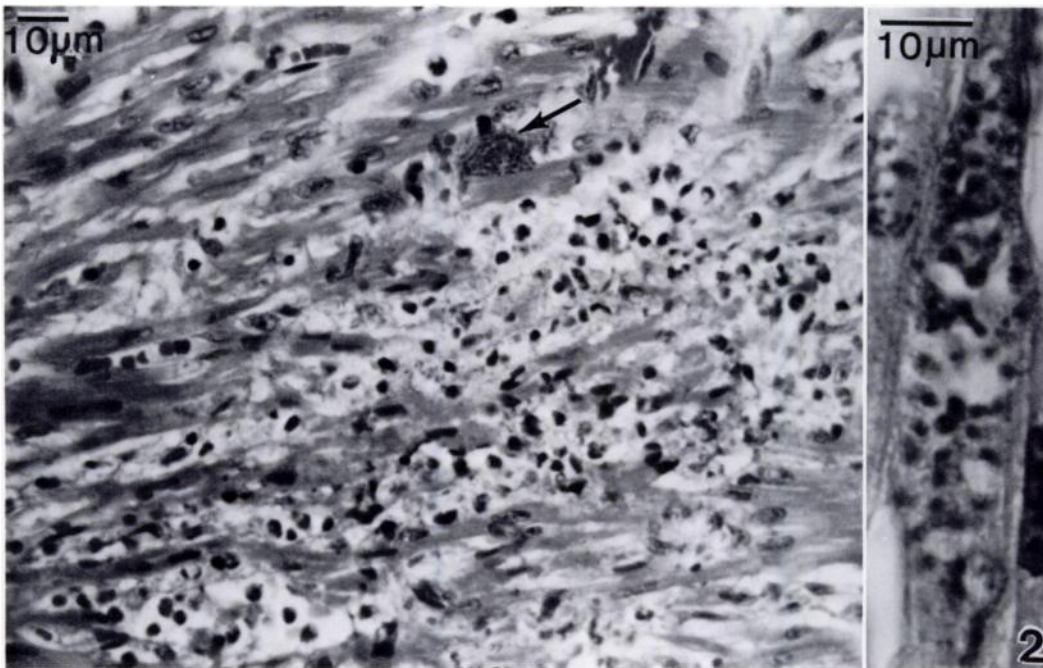
FIGURE 2. Myocardium of bobcat showing necrosis of myocardial fibers, infiltrations of leukocytes, and a group of T. gondii tachyzoites (arrow). H&E. Inset shows a group of tachyzoites within a myofiber. H&E.