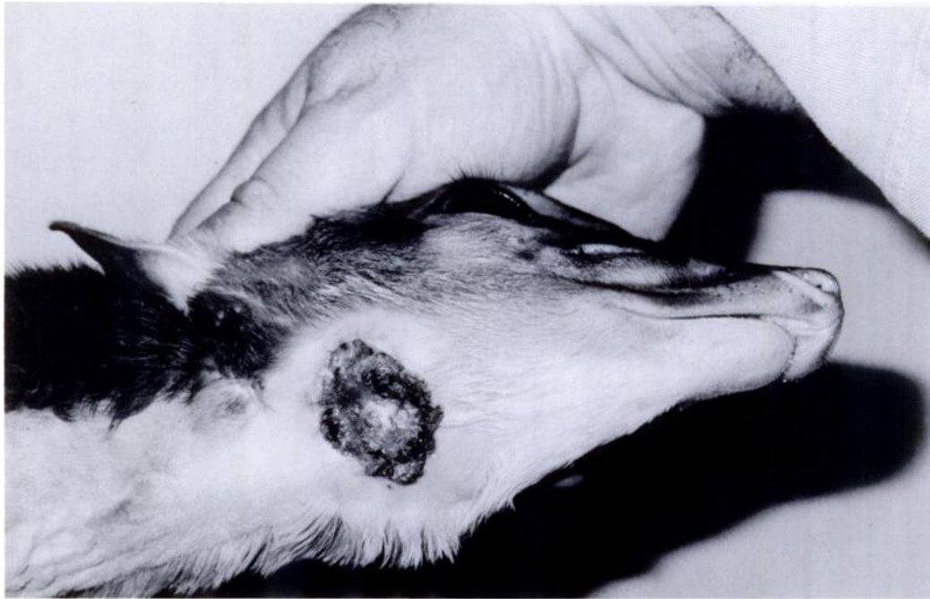
FIGURE 1. Draining right submandibular abscess from a blue duiker with a submandibular salivary gland fistula and extensive soft tissue necrosis.

mandibular bone; some were approximately four times normal thickness, primarily in mid shaft, tapering toward both ends with no gross abnormality of the associated dental arcade (Fig. 3). One duiker had a submandibular salivary fistula associated with the abscess site.