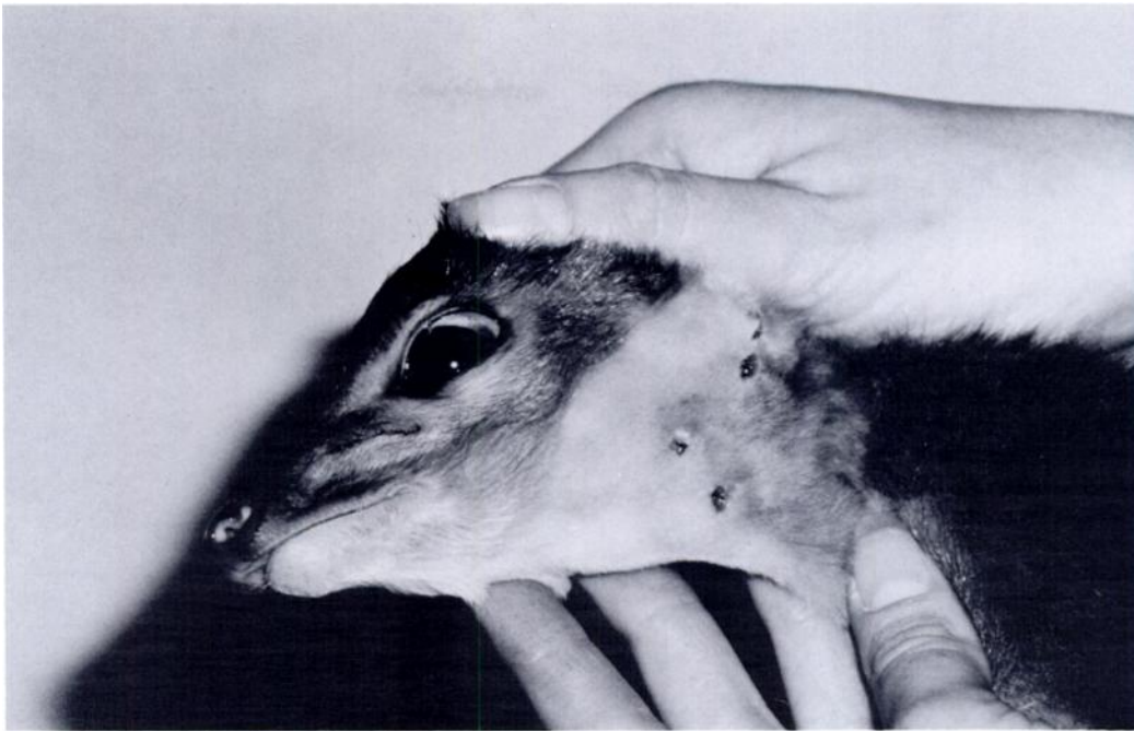
FIGURE 2. A young duiker exhibiting multiple draining sites of left facial abscessation extending from the base of the ear to the left jugular furrow.

by domestic livestock with footrot infections have been cited as contributing factors (Wobeser et al., 1975; Rosen, 1981; Carter, 1984). The blue duikers affected at our facility may have been overcrowded, especially when housed as an adult trio with nursing offspring. However, facial and mandibular abscesses in this herd appear to be related to the introduction of infected carrier animals brought to the PSU Deer and Duiker Research Facility from another zoological garden, coarse feed texture and masticatory behavior. Abscesses were most often on the right side of the face or jaw which correlates with observed patterns of mastication. The majority of duikers in the herd chew with a clockwise motion in which most of the food is kept on the right side of the oral cavity as the mandible is shifted (B. L. Roeder, unpubl. obs.). Fusobacterium necrophorum is usually considered to be unable to penetrate the intact mucosa (Jubb et al., 1985) and sharp or coarse plant material such as grass awns or forage particles are implicated as im-