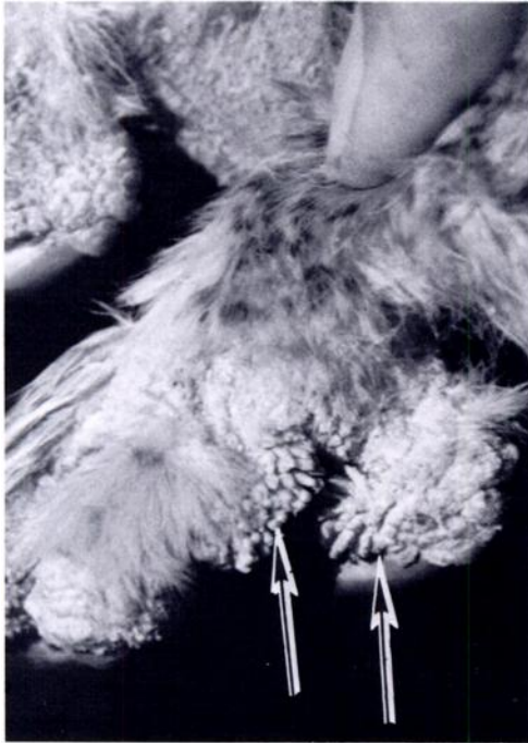
FIGURE 2. Gross skin lesions on the plantar surface of the foot of a great-horned owl showing proliferative papillary hyperkeratosis.