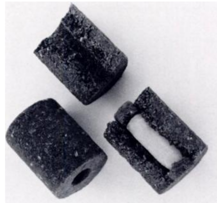
FIGURE 2. Fishmeal polymer bait and wax ampule.

Mammalian species composition on Parramore Island included both target and nontarget species: raccoons ( Procyon lotor ); red foxes ( Vulpes vulpes ); white-tailed deer; river otters ( Lutra canadensis ); grey squirrels ( Sciurus carolinensis ); and eastern cottontail rabbits ( Sylvilagus floridanus ). Raccoon tracks and scat were abundant on Parramore Island; red foxes were occasionally seen (approximately once a week) and scats and tracks were easily found. Sightings of white-tailed deer were frequent (approximately one every 2 to 3 days). River otter sign was present only at two sites on Parramore Island. Grey squirrels were observed only on the north end of Parramore Island near the Coast Guard station. There were three sightings of eastern cottontail rabbits on the island. Three hundred small mammal trap nights (Sherman live-traps) yielded only one marsh rice rat ( Oryzomys palustris ) and two house mice ( Mus musculus ). The other small mammals previously reported on Parramore Island (Dueser et al., 1976, 1979), muskrats ( Ondatra zibethicus ), meadow voles ( Microtus pennsylvanicus ),