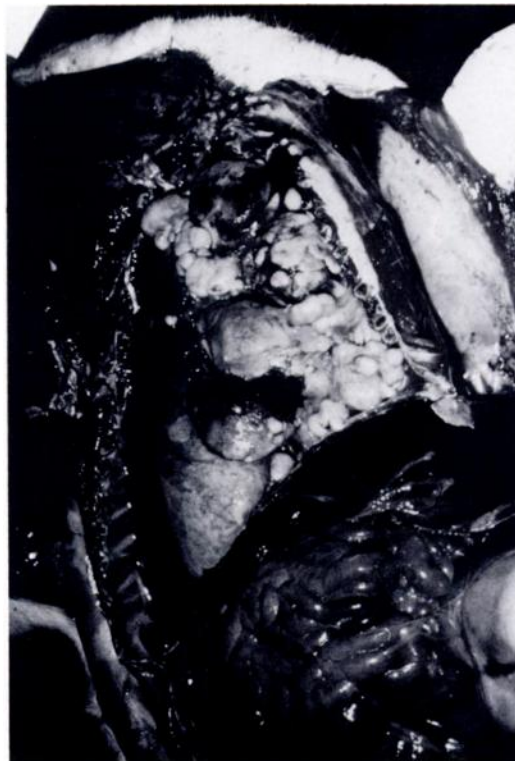
FIGURE 1. Light colored clusters of broad based tumors on the pleura of the thoracic cavity, diaphragm, lung and pericardium of a European fallow deer; fluid fills both cavities.

moderate collagenized stroma (Fig. 2). In some areas, the tumor cells were loosely arranged while in other foci, double rows and clumps of cells with a few binucleate cells were seen. Mitotic figures were not found. The adjacent pleura was edematous and contained a few dilated lymphatic vessels and multifocal lymphocytic infiltrates. The subjacent pulmonary parenchyma was partially atelectatic as a result of the expansive growth of the overlying tumors. Neoplastic cells were not found in the regional lymph nodes or the broken