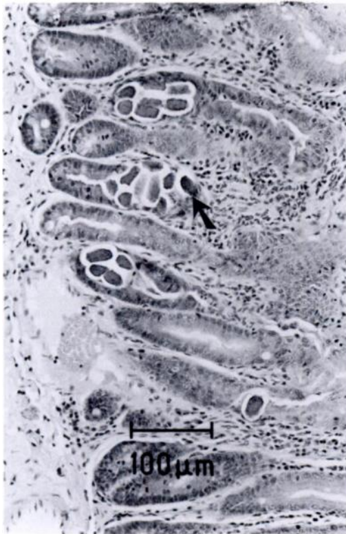
FIGURE 4. Moderately hyperactive crypts and infiltration of mononuclear cells and eosinophils through lamina propria of small intestine of a cotton rat with Strongyloides sp.; note embryonated egg within the crypts (arrow). H&E.

hosts, including hamsters, guinea pigs, white rats, mice and rabbits, with subcutaneous injections of large numbers (1,000 to 1,200) of filariform larvae. They were unsuccessful at infecting these potential hosts, concluding that S. sigmodontis is host-specific for the cotton rat.