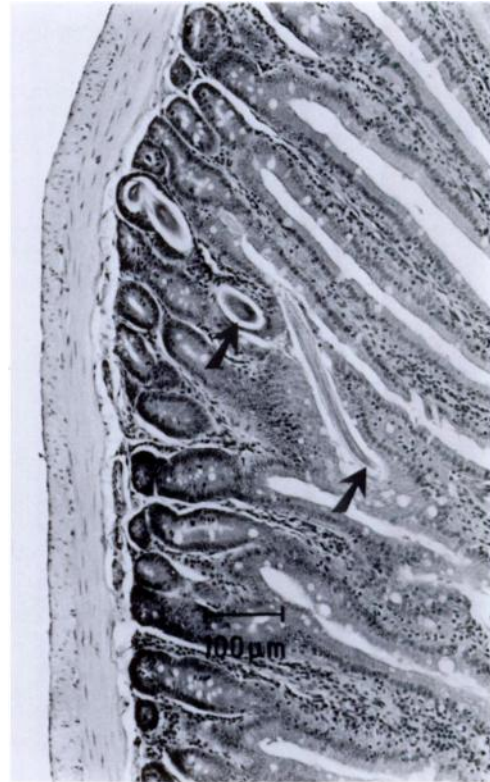
FIGURE 3. Small intestine from a cotton rat; note fragments of migrating larva (arrows) of Strongyloides sp. within the small intestinal crypts. H&E.

small body diameter (21 to 42 \mu\text{m} ) and darkly stained ovaries and ova (Fig. 1). Diagnosis was supported by their intense staining capacity, size of ova, site of infection and frequent presence of eggs in cross sections (Chitwood and Lichtenfels, 1972). A moderate inflammatory response to the larvae of Strongyloides sp. characteristically included atrophic villi, moderately hyperactive crypts, epithelial hyperplasia and infiltration with lymphocytes, plasma cells, and eosinophils in the lamina propria (Fig. 4). Occasionally, the crypt lumina contained degenerate, necrotic sloughed epithelial cells. In mild inflammatory responses, changes in the villi and crypts of Lieberkuhn, including infiltration with lymphocytes and plasma cells in the lamina propria, were minimal. Submucosa and serosa of the small intestine essentially were normal. Microscopic