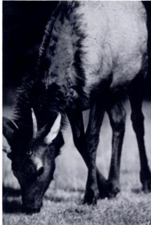
FIGURE 3. Yearling male elk from Banff National Park, Alberta, with winter tick-induced alopecia.

Mites of the genus Psoroptes are pests of wildlife and domestic animals in many countries (Lange et al., 1980; Welch and Bunch, 1983; Kirkwood, 1986; Cole and Guillot, 1987). The effects of Psoroptes sp. on elk have not been studied as extensively as those of Psoroptes ovis on domestic cattle (Stromberg and Fisher, 1986; Stromberg et al., 1986; Cole and Guillot, 1987; Stromberg and Guillot, 1989), but pathogenic events are probably similar. Severity of clinical disease in cattle is determined by mite density (Stromberg et al., 1986). Adult female mites lay many eggs in a short time and in cattle at least, mite infestation can result in severe exudative dermatitis and death 7 and 9 wk after infestation, respectively (Cole and Guillot, 1987). Domestic cattle with >15% of the skin surface manifesting dermatitis have reduced daily weight gains while those with 40% or more of the skin involved may die