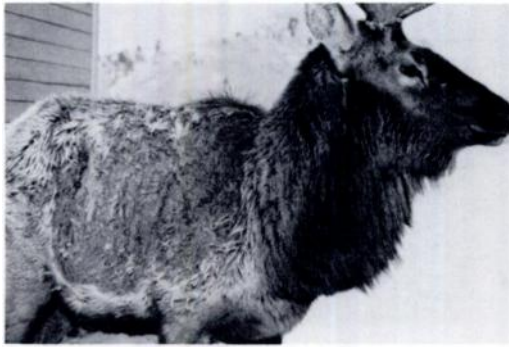
FIGURE 1. Adult male elk from the National Elk Refuge, Wyoming, with severe psoroptic scabies.

ent on elk with scabies, but lice were present on five other elk and abundant on two calves (Table 1).