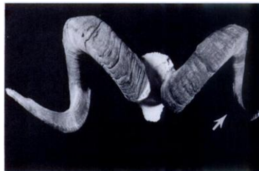
FIGURE 1. Asymmetric growth of left horn (arrow) in a Dall ram.

The right cornual process and sheath appeared normal. Based upon visual characteristics, the abnormal growth of the left horn appeared to be due to chronic epidermitis and osteomyelitis of the cornual process (Fig. 2). Caudal and lateral aspects of the cornual process and the flattened portion of the base contained numerous pits and crevices 1 to 8 mm in diameter and 1 to 3 mm deep. There was a large cavity (20 mm in diameter and 10 mm