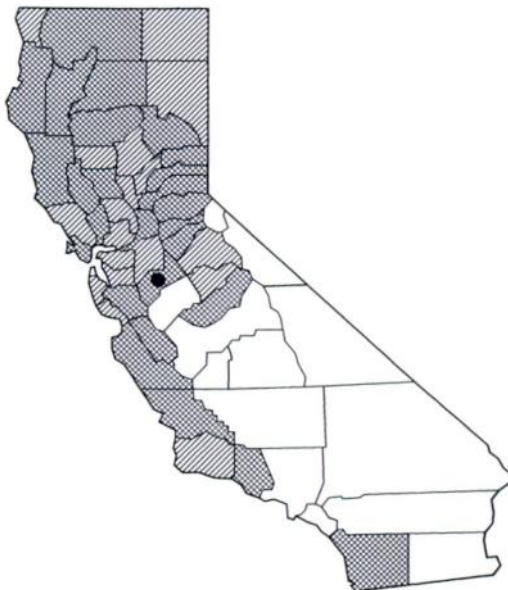
FIGURE 5. Distribution of blacktail deer (▨) and location of animals sampled for antibodies to Brucella spp. (●) in California by county, 1977 to 1989. ●, counties with reactor animals.

Twenty-three of 611 (3.8%) feral swine were considered reactors (Table 4). Subadult animals comprised 40% of the sample population, but accounted for 78% of the reactors. Subadult males comprised 52% of the reactors. Incomplete agglutination reactions to a rivanol, STT, or SPT