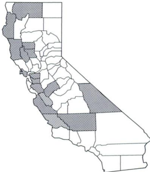
FIGURE 2. Distribution of elk (▨) and location of animals sampled for antibodies to Brucella spp. (■) in California by county, 1977 to 1989. ●, counties with reactor animals.

the feral swine samples were from an incomplete herd test and with the variation in test batteries used, feral swine were considered reactors if they exhibited complete agglutination