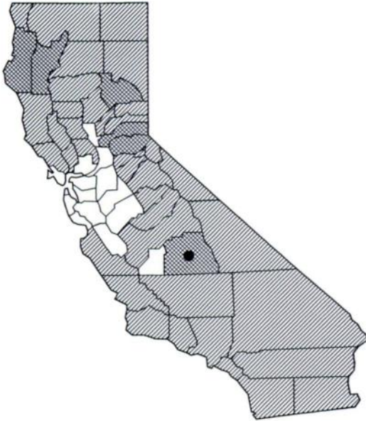
FIGURE 1. Distribution of black bears (▨) and location of animals sampled for antibodies to Brucella spp. (■) in California by county, 1977 to 1989. ●, counties with reactor animals.