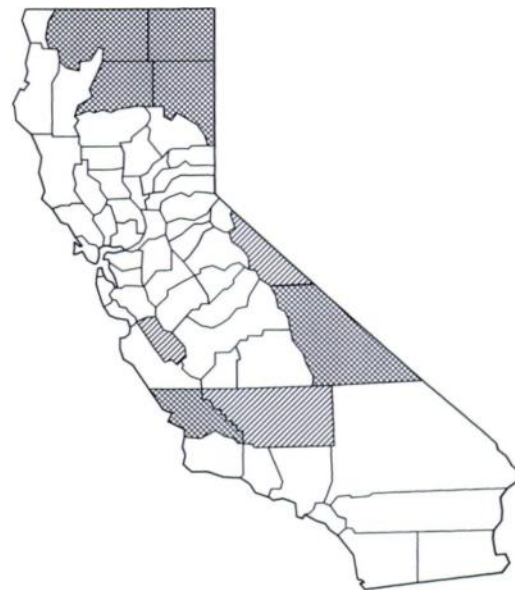
FIGURE 6. Distribution of pronghorn antelope (▨) and location of animals sampled for antibodies to Brucella spp. (●) in California by county, 1977 to 1989. ●, counties with reactor animals.