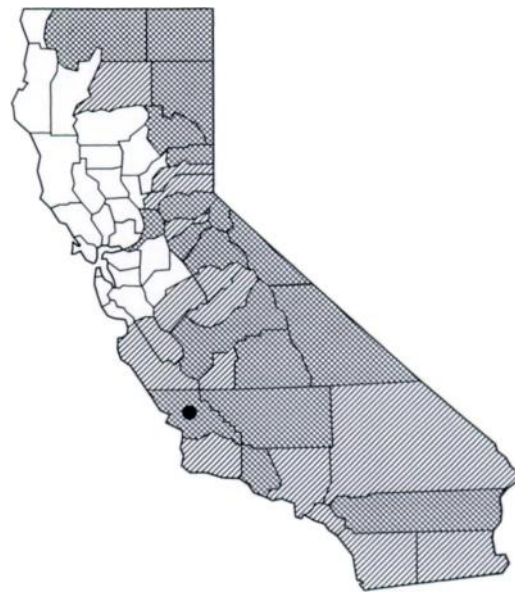
FIGURE 4. Distribution of mule deer (▨) and location of animals sampled for antibodies to Brucella spp. (■) in California by county, 1977 to 1989. ●, counties with reactor animals.