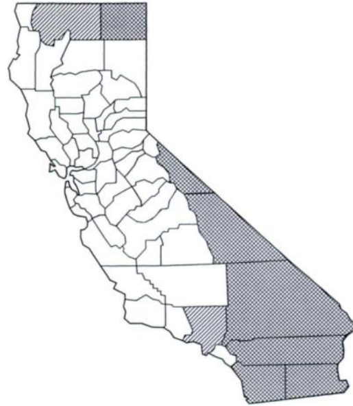
FIGURE 3. Distribution of bighorn sheep (▨) and location of animals sampled for antibodies to Brucella spp. (■) in California by county, 1977 to 1989. ●, counties with reactor animals.

were classified as suspects if they exhibited partial to complete agglutination on an SPT at any dilution or a positive BAPA on initial screening with no positive supplementary tests. Because