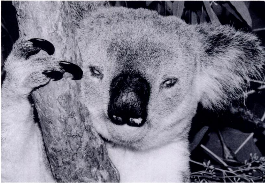
FIGURE 1. Koala showing bilateral old keratitis and opaque corneas from old keratitis.

oedematous nor infiltrated with inflammatory cells, and the conjunctiva was unremarkable.