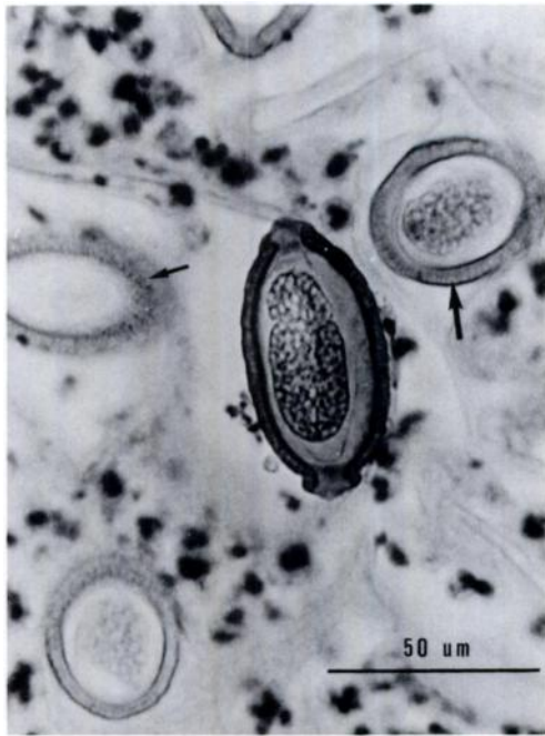
FIGURE 1. Trichinelloid eggs in lumen of bronchiole of Aepyprymnus rufescens . Note the surface punctations (small arrow) and the reticulated appearance at the edges (large arrow). (H&E).