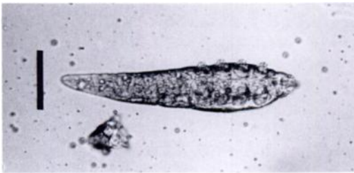
FIGURE 2. Specimen of Demodex sp. from skin scraping of a black bear in Florida. Bar = 50 \mu m.