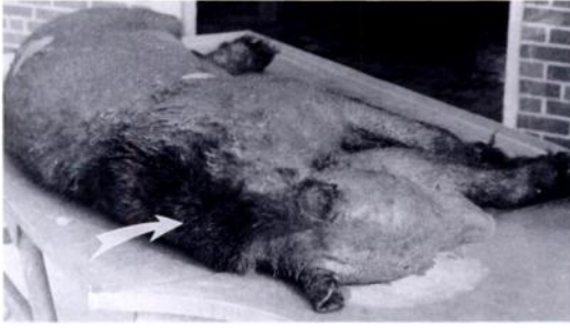
FIGURE 1. Adult male black bear from Florida with severe alopecia. Note normal pelage on neck region (arrow).

cysts were present in the liver at a single focus. There was mild chronic interstitial nephritis. Nodules in the cortex of lymph nodes consisted of focal areas of follicular hyperplasia. Specimens of Demodex were not seen in peripheral lymph nodes.