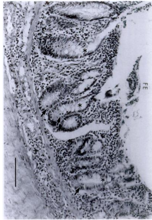
FIGURE 2. A section through the distal small intestine of the M. clarki -infected gray squirrel at an area near an acanthocephalan attachment site. There is lymphocyte and neutrophil infiltration in the lamina propria and submucosa, goblet cell hyperplasia, goblet cell exhaustion (asterisks), epithelial cell proliferation (arrows) and apolarization of enterocytes. Eosinophils and neutrophils are noted in the fibrinopurulent exudate (FE) in the gut lumen. H&E. Bar = 50 \mu m.

secretion (Fig. 2). Acanthocephalan attachment areas in the small intestine were noted by epithelial cell compression (Fig. 1) and an abundance of eosinophils, neutrophils and giant cells. Epithelial cell abnormalities included elongation, atrophy, nuclear apolarity and disorganization (Figs. 1, 2). Capillaries of the submucosa and tunica muscularis were dilated. Hemorrhagic areas and mild leukocytic infiltration were found near perforating ulcers. Hematomas also were visible on the serosal aspect of the intestinal tract. The gut walls were flaccid and the mucosa and submucosa were atrophied at the intestinal-caecal juncture.