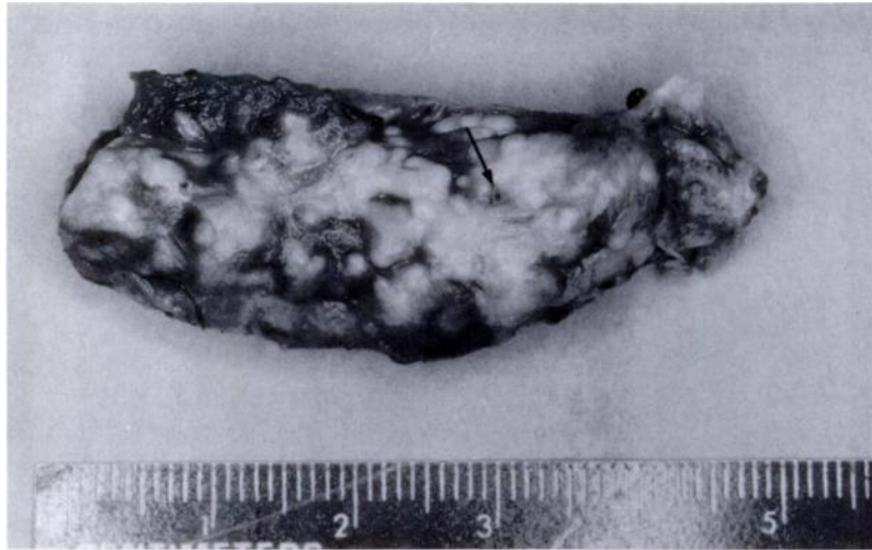
FIGURE 1. White nodules (granulomas) containing larval Spiroxys contorta (arrow) in stomach of Apalone spinifer pallida .