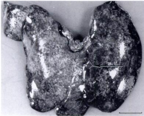
FIGURE 1. Liver of a muskrat with massive infection with Capillaria hepatica . Serpiginous necrotic tracts are seen under the liver capsule (arrow). Bar = 1 cm.

Histologically, infected livers had multifocal areas of C. hepatica infection, varying in severity. In mild cases single eggs or small groups of eggs were found among hepatocytes, without inflammation or with a minimal mononuclear infiltrate surrounding them. In more severe infections there was a marked, multifocally coalescent granulomatous, eosinophilic hepatitis replacing the normal hepatic parenchyma; eggs were found within these granulomatous lesions (Fig. 2). Most eggs were intact and in the four- to eight-cell morula stage. Eggshell disruption and dystrophic calcification were present in some. In a few cases adult gravid females occurred within the liver (Fig. 3). These were found either between intact hepatocytes, with no inflammatory infiltrate, or within foci of severe, eosinophilic, granulomatous hepatitis. In general, the most severe hepatic necrosis and granulomatous response was associated with disintegrating adult worms. In cases with dead, disintegrating adult worms and associated granulomatous hepatitis, there was fibrosis, but no liver regeneration was observed.