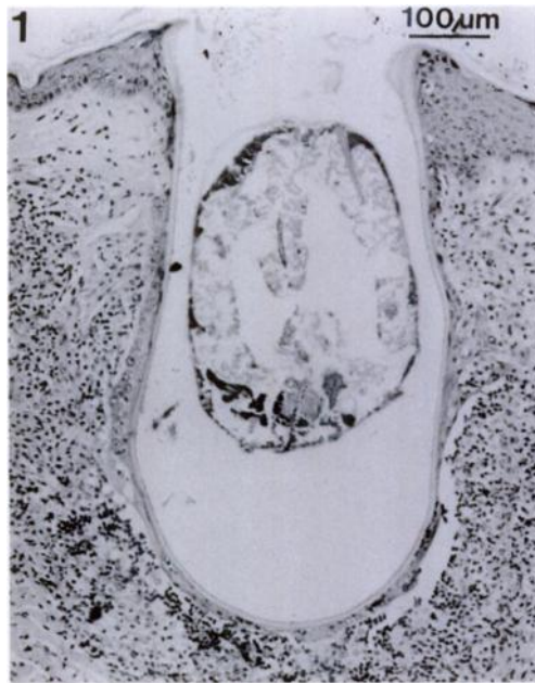
FIGURE 1. Section of skin of a yellow-footed rock wallaby showing a larval mite located in the lumen of the capsular invagination formed during feeding. H&E.

Adelaide Zoological Gardens, where it was noticed to be suffering from an extensive moist, pustular dermatitis affecting the inguinal, abdominal and axillary regions. We observed clusters of mites on the external pinnae and collected specimens for identification. Subsequently, on 26 February a skin scraping was taken from the right, medial inguinal area and six mites were recovered. The mites collected from both sites were confirmed to be larval instars of O. adelaideae according to the descriptions of Southcott (1989). An occasional louse, identified as Heterodoxus ampullatus according to the description of von Kéler (1971) was observed free in the body hair. As far as we can ascertain this is the first record of lice on this host; however, Clay (1981) depicts H. ampullatus from an unspecified species of rock wallaby at Bindina Springs in South Australia but does not provide supporting comment in the text. Representative specimens of the two parasite species have been deposited with the South Australian Museum (Adelaide,