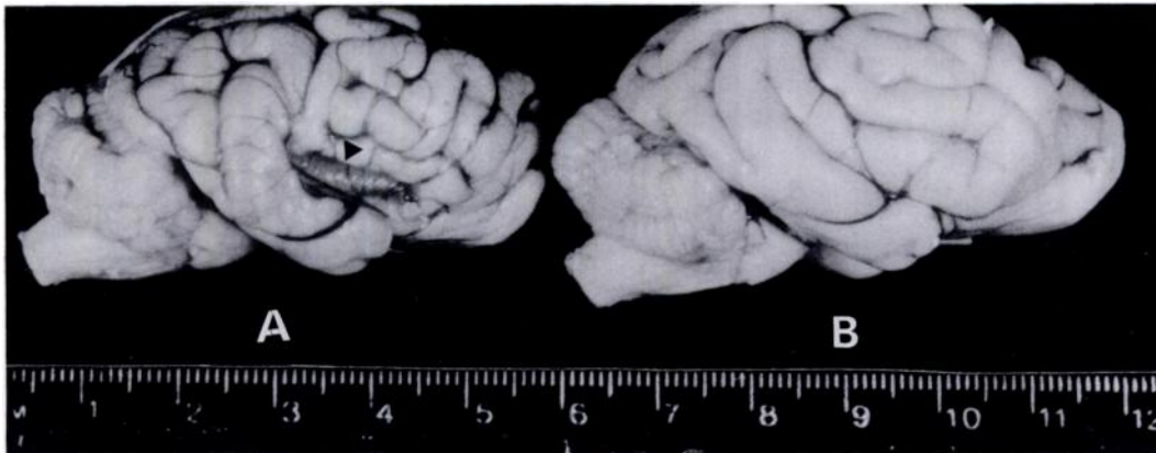
FIGURE 1. A—Brain of raccoon (case 1) showing a focal elongated depressed area (arrow head) of ischemia. B—Normal raccoon brain for comparison. Scale in cm.

multifocal mineralized areas, which appeared to have occluded their lumina.