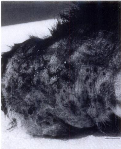
FIGURE 1. Photograph of alopecic area of skin on the dorsal aspect of the head of a striped skunk infected with Filaria taxideae showing the multifocal hemorrhagic crusts resulting from filarial dermatitis. Bar = 1.4 cm.

heart, lung, liver, spleen, kidney, stomach, intestine, pancreas, and brain were fixed in neutral buffered 10% formalin, embedded in paraffin, sectioned at 5 \mu m, and stained with hematoxylin and eosin (H&E) for histologic examination. Aseptically collected swabs of cutaneous abscesses were submitted to the Athens Diagnostic Laboratory (Athens, Georgia, USA) for aerobic bacterial culture according to standard bacteriologic techniques (Ikram and Hill, 1991). Briefly, swabs were streaked onto 5% sheep blood agar plates directly and after overnight enrichment in thioglycolate broth at 37 C. Inoculated plates were incubated at 37 C, and bacterial colonies identified visually and via testing with an o-nitrophanlyl- \beta -d-galactopyranoside disc (Becton Dickinson & Co., Rutherford, New Jersey, USA). Sections of the cerebrum including hippocampus were submitted to the same laboratory for fluorescent antibody testing for rabies virus (Veleca and Forrester, 1981).