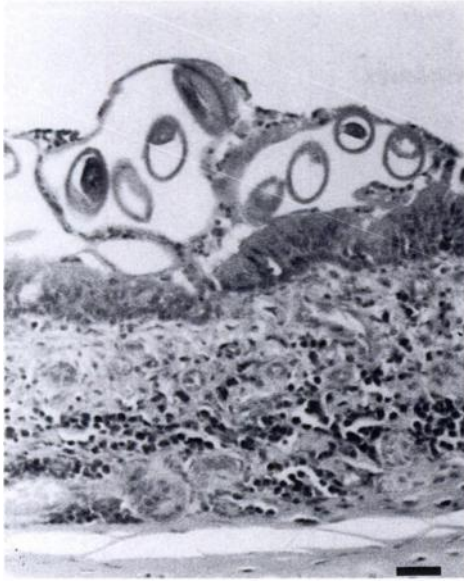
FIGURE 1. Histological section of trachea from a raccoon in Virginia showing eggs of Capillaria sp. within narrow tunnels in the tracheal mucosa. The subjacent lamina propria has moderate numbers of inflammatory cells. H&E, Bar = 120 \mu m.