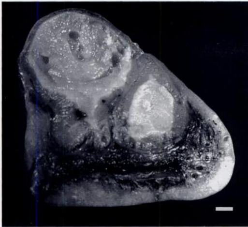
FIGURE 1. Ovary from a striped dolphin with two luteinized cysts. Bar = 3 mm.

son's trichrome, and periodic acid Schiff's reagent methods (Luna, 1992). The presence of morbillivirus antigen in tissues was assessed by immunohistochemistry using a previously published method (Kennedy et al., 1991), and a mouse monoclonal antibody (clone 1.3) against glycosylated hemagglutinin protein of phocine distemper virus as the primary antibody (Trudgett et al., 1991).