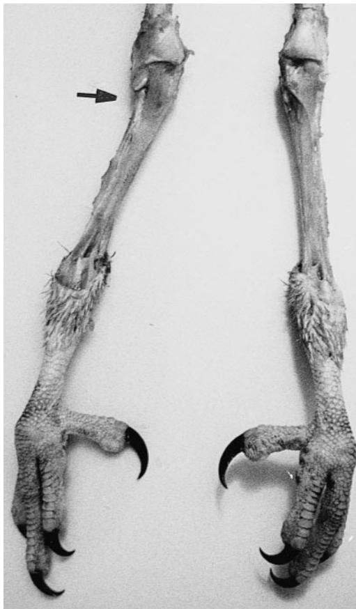
FIGURE 2. Lateral bowing, valgus deformity (arrow) in the proximal epiphysis of the left tarsometatarsal bone of a saker falcon nestling.