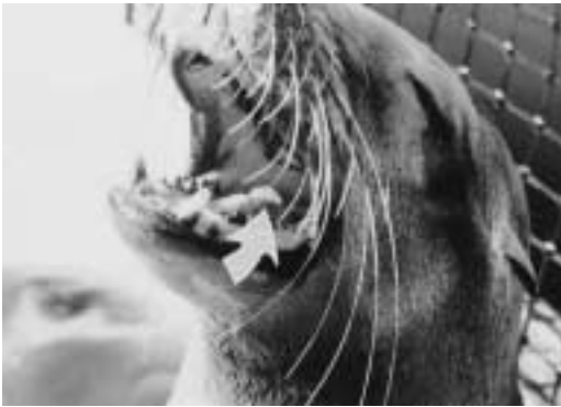
FIGURE 1. Clinical appearance of California sea lion with unerupted oral vesicle on tongue (arrow).

distinguishable from vesicular exanthema of swine, is also described.