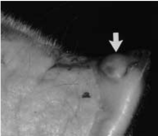
FIGURE 4. Typical lesions of snout in experimental swine infected with calicivirus FADDL 7005 (arrow).