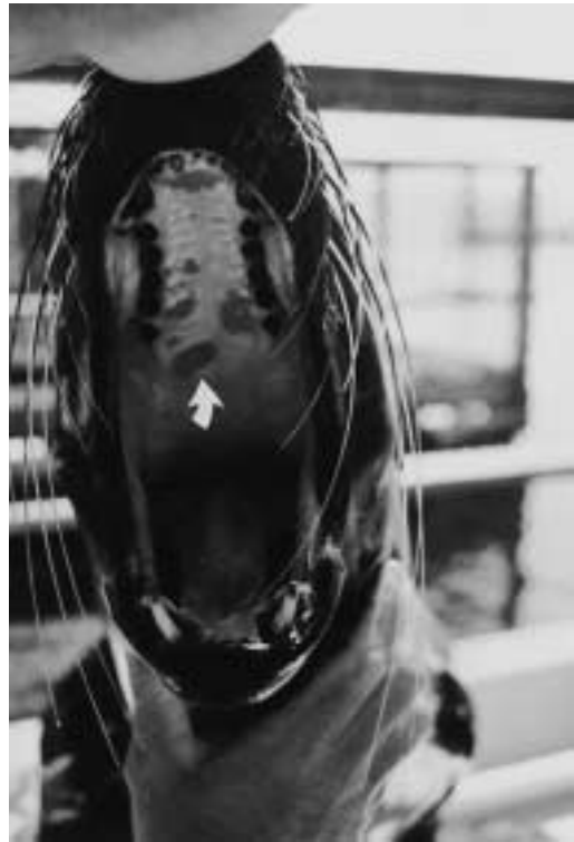
FIGURE 2. Clinical appearance of California sea lion with erupted oral vesicles on hard palate (arrow).

On 8 April 1997 one of the group animals, NIC, was brought to the attention of the veterinary staff with the complaint of poor appetite and reluctance to perform learned behaviors. The following day an erupted vesicle was noted on the sea lion's tongue and calicivirus infection was suspected. Whole blood and serum samples were collected with the animal restrained in a squeeze cage. Amoxicillin (SmithKline Beecham Pharmaceuticals, Philadelphia, Pennsylvania, USA) at 15 mg/kg and clindamycin (The Upjohn Company, Kalamazoo, Michigan, USA) at 12 mg/kg orally, twice daily, were prescribed. On 12 April this animal subsequently developed multiple vesicles of the hard palate and dorsal surface of the tongue, which were causing obvious discomfort (Figs. 1, 2). The animal stayed out of the water with mouth open and refused all fish offered. Topi-