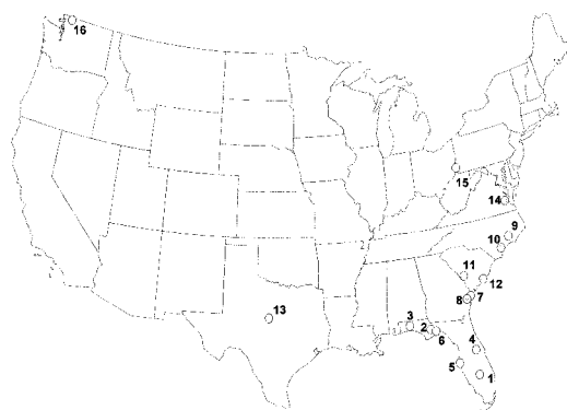
FIGURE 1. Distribution of raccoon collection sites for studies on ehrlichiae. Refer to TABLE 1 for information on individual sites.

ranged from 16 to 1,024, with a modal titer of 64 and an overall GMT of 60 (Fig. 2). Forty-six animals (11%) had a titer that exceeded the GMT for the group.